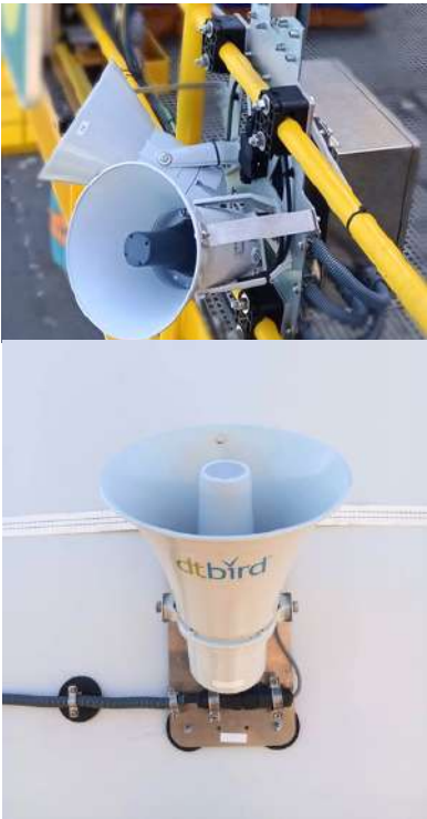
DTBird Collision Avoidance Module Speakers installed on the WTG tower. 4 to 10 Speakers can be installed per WTG.

ECOCOM in 2016 reported a reduction in flight time in the risk area of the rotor between 61%-87%. It triggers avoidance behaviour in 88% of cases where the bird is on a collision course with the WTG.