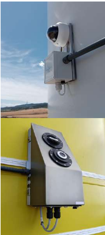
Latest DTBird models: FALCO (above) & ALBATROSS (below).