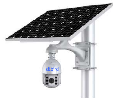
DTBird Autonomous PTZ model (55° to 15° horizontal lens angle).

* See DTBird Documentation: Detectability and Detection Distance Evaluation Report. August 2025.